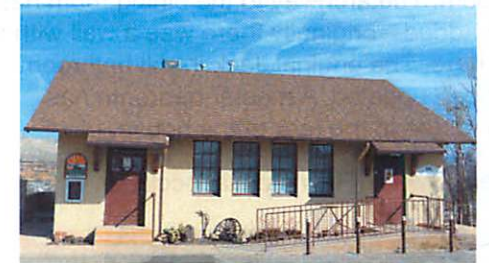
#2 900 First North Street (1918-20) - The Clarkdale Clinic (Dispensary) was built as an adjunct to the original company hospital next door (current Clarkdale Police Dept.). Designed by Arthur R. Kelly, it was built of hollow clay tile to withstand fire. The basement held a boiler room and nurses's quarters, with a waiting room and doctor's office on the main floor. The medical staff dispensed medicine and treated small injuries of the smelter workers and their families. The building later housed a youth center; the town hall for the newly incorporated town of Clarkdale, with the police department and a jail in the basement; the Clark Memorial

(White-collar, upper and top management residential area with variety of house styles and types)