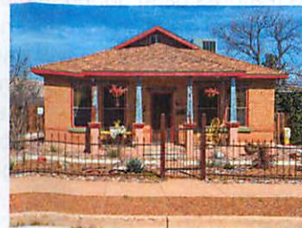
#1 416 Main Street (1913, cost $1,697) - This 3-room single-family brick home is Neoclassical

(Blue-collar residential area with rows of identical mass-produced homes typical of a company town)